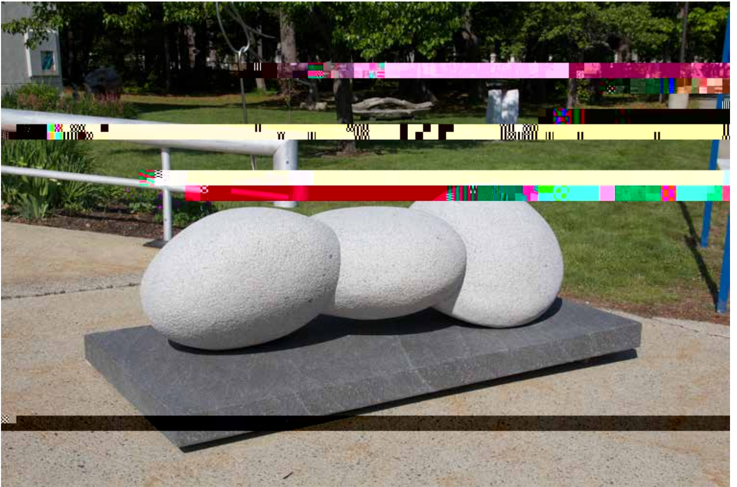
Composition Trio , 2015, granite, 4' x 8' x 3'